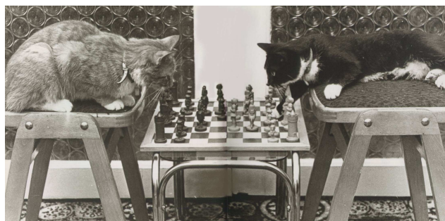
Happy Holidays From the ICA